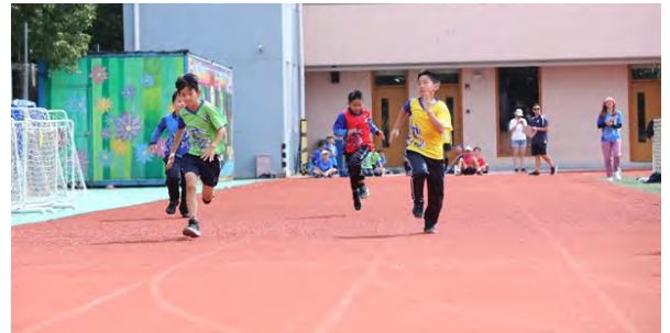
G5 Tiger boys in a very close 50m sprint.