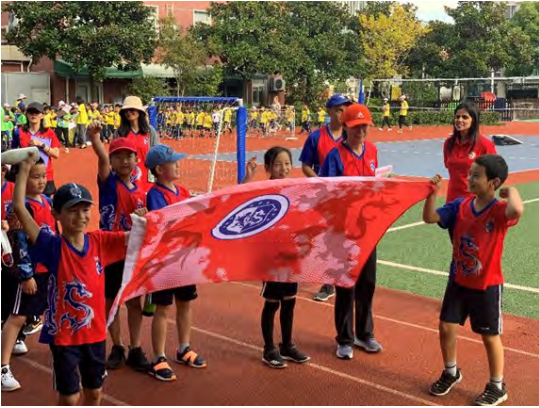
Red house during the parade.