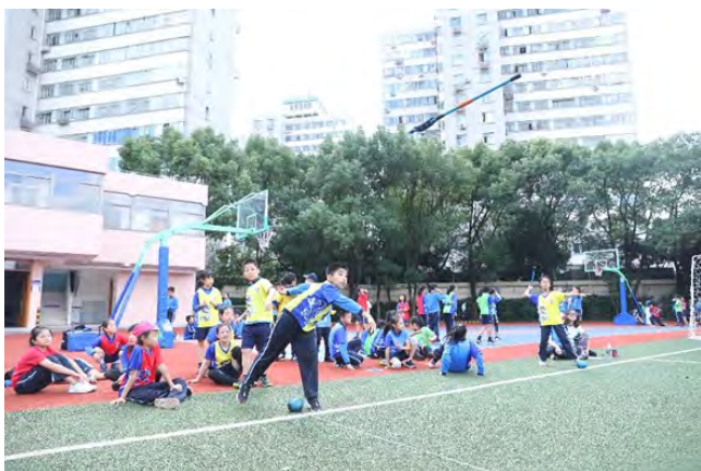
Blue house students during the 'caterpillar'.