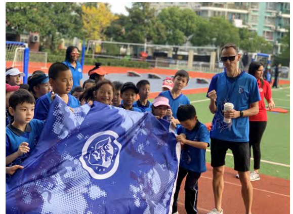
Blue house during the parade.