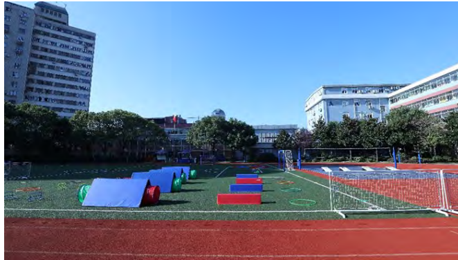
Sports Day set up

On Friday, October 9 th , and Saturday, October 10 th , all of the International Primary students had their Sports Days. All of the students were incredibly excited and nervous at the prospect of participating in all the events and earning points for their house.