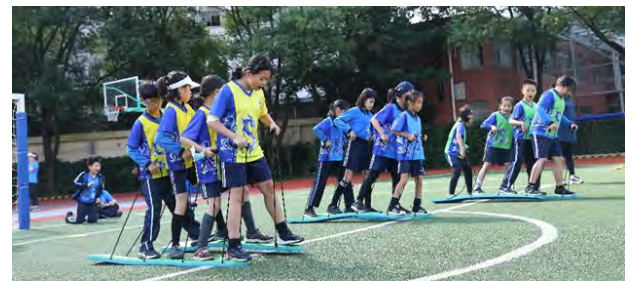
G4 Lion participating in the 'cooperative walk'.