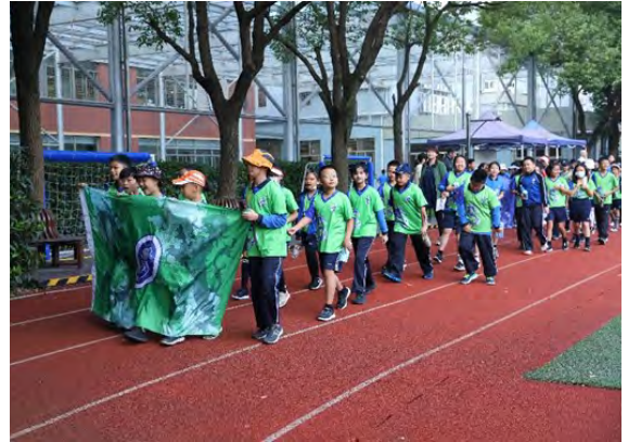
Green house during the parade.