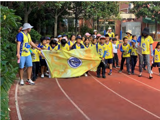
Yellow house during the parade.