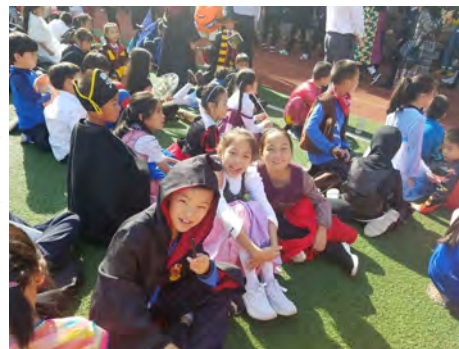
Getting Ready for Book Character Parade

The very next day had our educating and marvellous field trip . The petting indoor zoo had animals that could hop and skip.