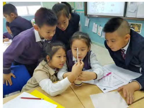
Grade 3 Panda students working together