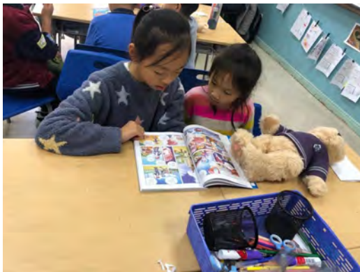
Grade 3 reading to Grade 1 students

It was such a thrilling and exhilarating November, We are getting jolly and excited now for December!