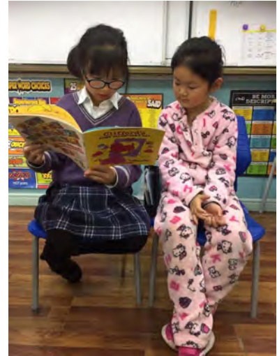
Grade 3 Lion students reading to Grade 1 Lion on PJ Day

The performance gave up a chance to speak, And now let me tell you about our fantastic book week!