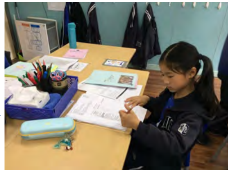
Completing all classwork

The month of November was fun-filled and interesting, The students enjoyed all the events they were witnessing.