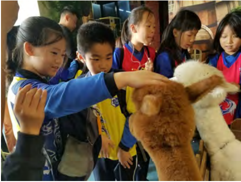
Loads of fun during Book Week

At the end of the month, all the children stood for us to see, And presented with expression their wonderful poetry.