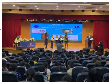
G3 Finalists in the Poetry Performance

All the students were looking for different characters and became spotters. To locate all superheroes, villains and multiple Harry Potters.