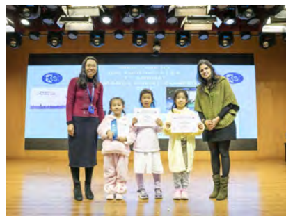
three finalists Gr1

Another highlight was the very exciting run up to the amazing Poetry contest. The Grade 1 classes worked really hard to learn and recite poems and they practiced using actions, props and expressions.