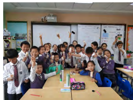
Grade 3 Dragon Birthday Celebration