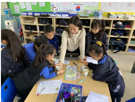
Ms Qin checking with students in our melting chocolate investigation