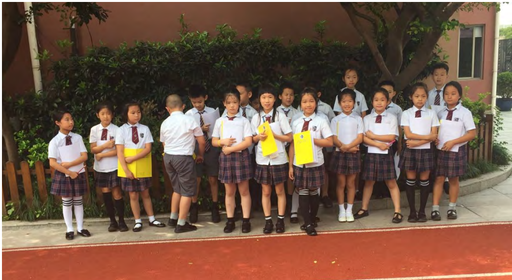
G3 Pandas whole class photo

We can't wait to show more about G3 and all of our excellent school activities.