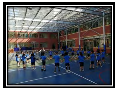
G1 Panda outside activities