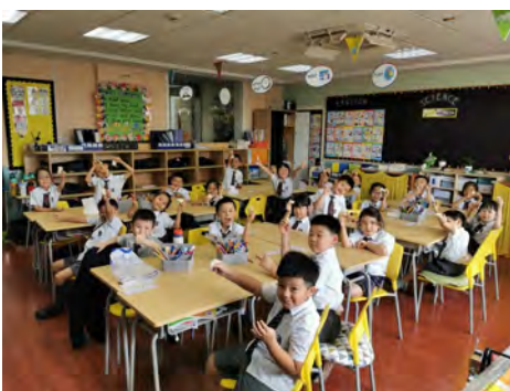
G1 Dragon Bread experiment in Science class