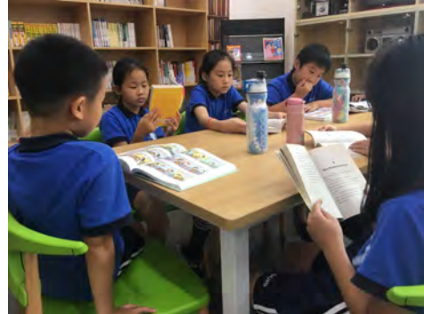
G3 Dragons Students reading in the library

We have been back for just over one month of school and it already feels like we have a great learning community. Students have come back to school with friendly and positive smiles; all ready for a new grade in a new class. Our teachers have been eagerly waiting these students, with thoughtful and interesting lessons and tasks for students to participate in.