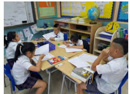
G3 Pandas busy reading from the class library