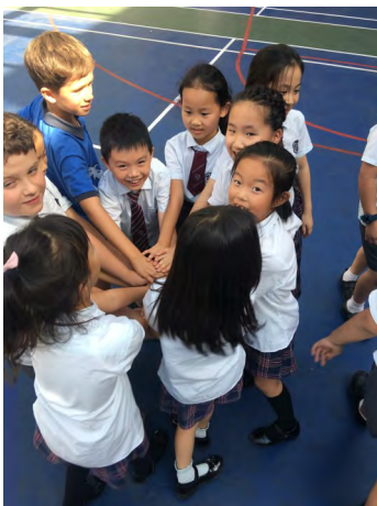
Grade 3 Dragon students all part of a team