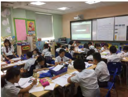
G3 Lions hard at work in English class

Even though we have just only started our fun-filled school year, here is quick snapshot of what the students have been learning. In English, students have been getting feel for Guided Reading, where they participate in various reading activities to gain more understanding and a also a love of reading. Students have been reviewing stories, including a humorous extract from librarian who likes to use her potato "Spud Gun" on misbehaving children. Our young little scientists have been reviewing the scientific method and have just started a unit on bones and muscles. In Theme, our enquiry-based program, students have been researching all the different countries in Asia. All teachers are very pleased with the way students have been researching information about all the different Asian countries.