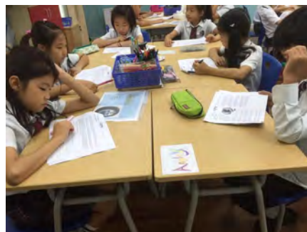
G3 Lions reading in Guided Reading