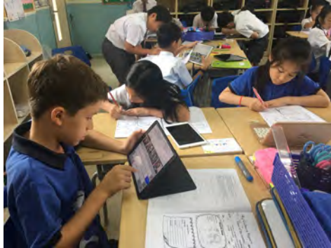
G3 Dragons researching an Asian country using Ipads