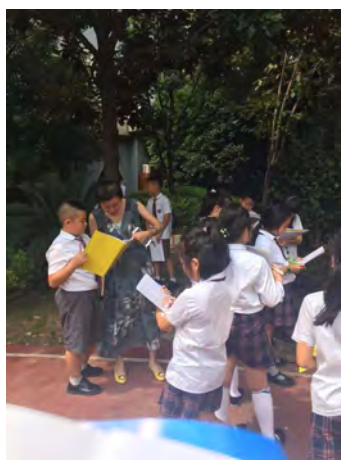
G3 Pandas doing their science investigation outside