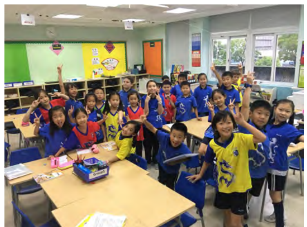
Grade 3 Dragons whole class photo