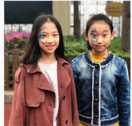
Earth Day ▲▲▲

Speaking as homeroom teachers, we are sure the list could go on, and on. A very eventful and enjoyable year was had by all !