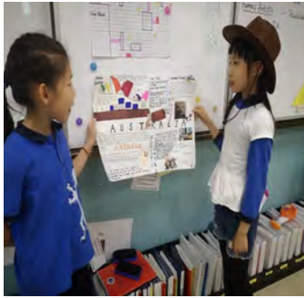
Grade 2 Pandas

Grade two had a splendid time exploring various cultural activities such as country presentations by students and parents, food tasting, colouring and game rotations within the grade . We also enjoyed the whole school parade.