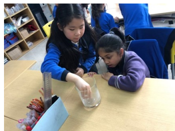
Grade 1 Lion

G1 Dragon have begun the 'Discovery Quest' challenge. This enables the students to work towards becoming confident and clear speakers of the future.