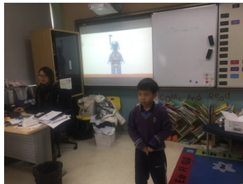
Grade 1 Dragon

We are learning capacity and volume. We can use a litre and half-litres to make and recognise different capacities.