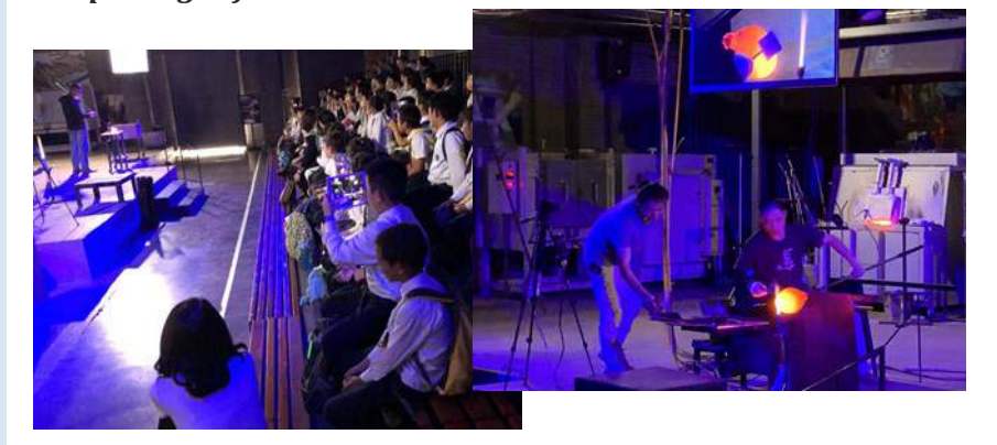
Learning how glass is made in the Performance Hall.