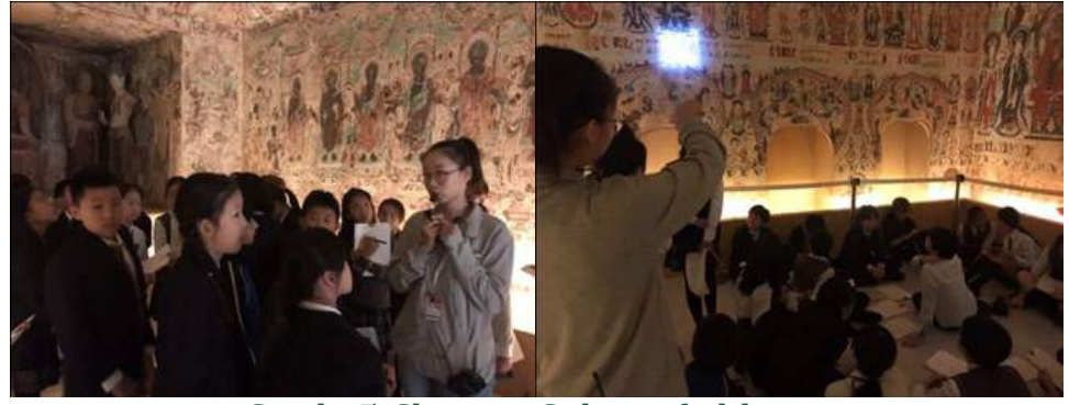
Grade 5 Chinese Culture field trip Ancient history of the Silk Road

This semester grade five students have embarked on field trips in and around the Pudong vicinity.