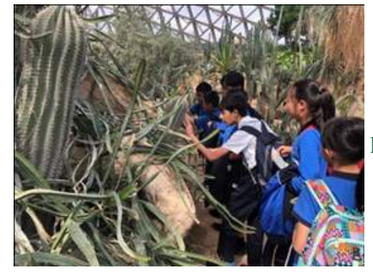
Grade 5 Science field trip Exploring the botaical garden of Chenshan

A mind that is stretched by a new experience can never go back to its old dimensions.