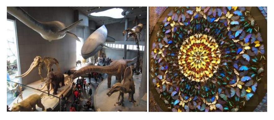
Shanghai Natural History Museum, on 6th December 2018.