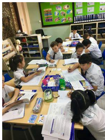
Concentrating hard on independent work