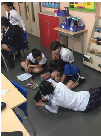
Group work in action

Working together on prologues in English class